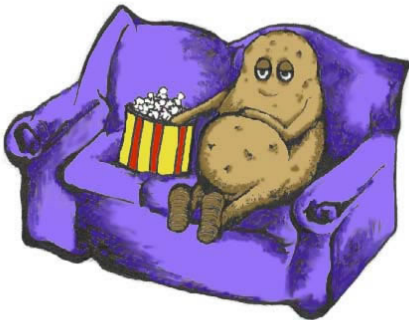
lazy, lazy person