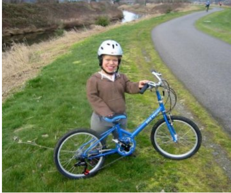
a short person